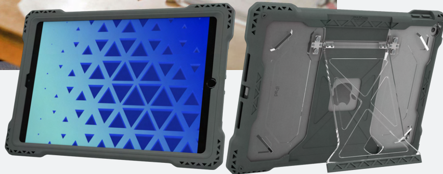
Custom-fit for the iPad 9/8/7

Exponentially more protective and with more functional features than its predecessors, the Shield Extreme-X2 provides a perfect fit for the iPad 9 and other 10.2" iPads. The new design layers soft TPE inside with a tough TPU exterior for greater shock dissipation to protect from drop and impact damage. The removable screen protector enables easy replacement and reinsertion as needed. The virtually break-proof FlexStand kickstand provides unlimited, stable positioning options thanks to the easy-sliding friction hinge. The custom-fit design delivers easy access to all ports, openings, and buttons. Durable, updated corner anchors make it easy to add an (optional) hand strap, shoulder strap or any clip-on accessory.