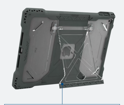
Smooth friction-hinge kickstand delivers unlimited positioning

AP-SXX2-IP9-BLK SHIELD EXTREMEX2 FOR IPAD 9 10.2"