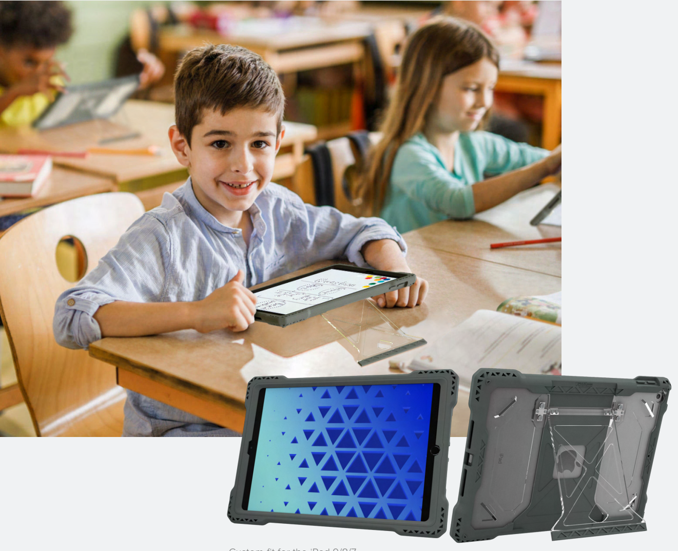
Custom-fit for the iPad 9/8/7

Exponentially more protective and with more functional features than its predecessors, the Shield Extreme-X2 provides a perfect fit for the iPad 9 and other 10.2" iPads. The new design features dual layers of tough TPU for outstanding impact and drop protection: a cushioning inner layer of TPU with an oil- and dirt-resistant outer layer. The removable screen protector enables easy replacement and reinsertion as needed. The virtually break-proof FlexStand kickstand provides unlimited, stable positioning options thanks to the easy-sliding friction hinge. The custom-fit design delivers easy access to all ports, openings, and buttons. Durable, updated corner anchors make it easy to add an (optional) hand strap, shoulder strap or any clip-on accessory.